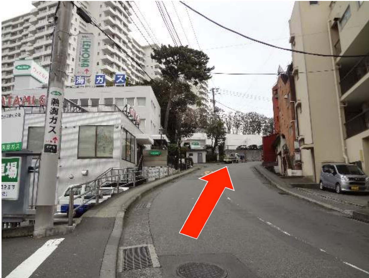
8. Continue uphill.