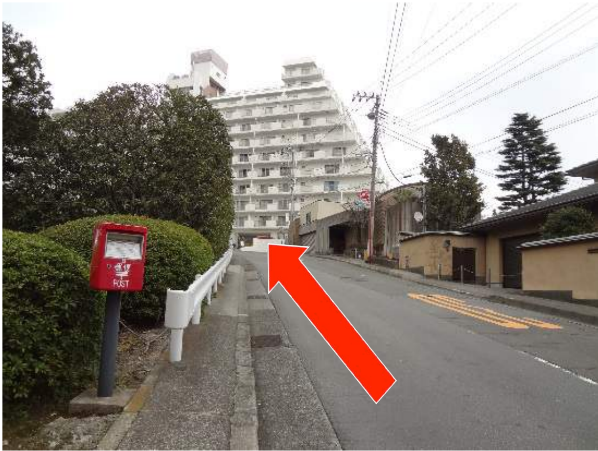
9. Continue straight, passing by a large white resort/apartment building.