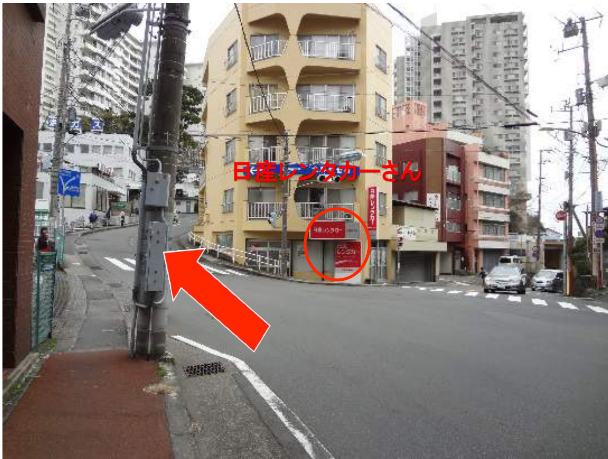
7. At the next intersection Google maps and other navigation programs will tell you to turn right and go downhill towards the ocean. These directions are incorrect. Take a left and start climbing the hill.