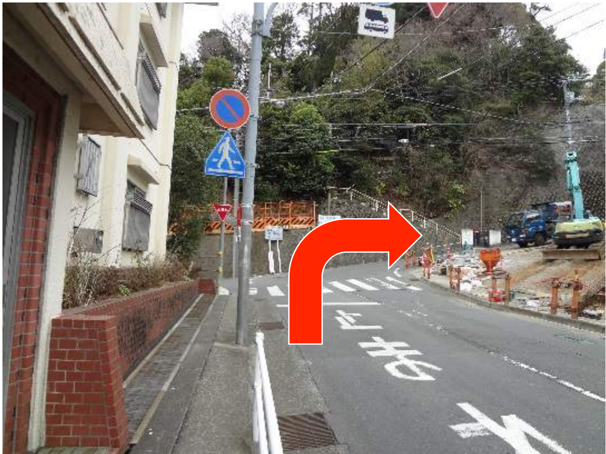
10. At the next intersection follow the sign that says MOA by taking a right. Be sure to fully stop at the intersection. Many cars pass by and it is very hard to see them coming.